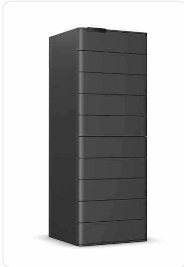
Frameless Expansion 10D Expansion cabinet with 10 storage drawers. Drawer: 277x220x45 mm Dimension: 300x300x810 mm Weight: 70 kg