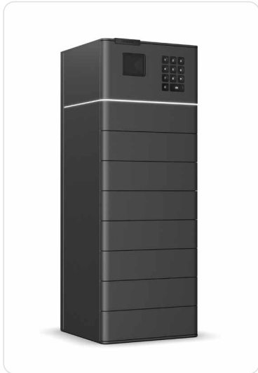
Frameless Control 8D Main cabinet with 8 storage drawers. Drawer: 277x220x45 mm Dimension: 300x300x810 mm Weight: 70 kg